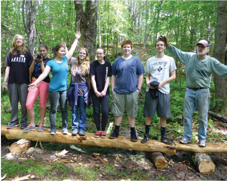
Traip sophomores celebrate their new bog style bridge at Norton Preserve.