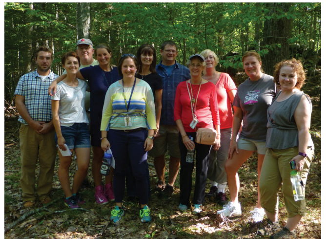
Shapleigh 5th & 6th grade teachers prepare for BBHeadwaters field trip